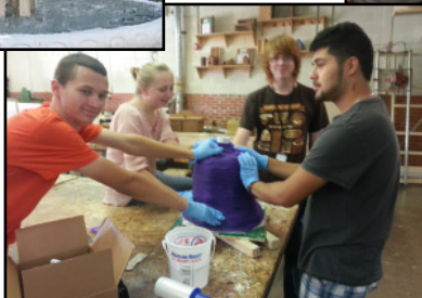
Students of today preserving the gifts from students who have gone before them. Colts Forever!