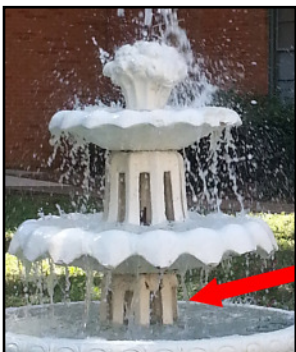
Red arrow points to broken support.