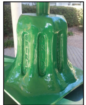
Can you guess the three words inscribed on the grooves of the mold?